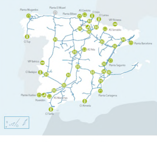
Pantas 🖓 Almacanamientos 🗟 telaciones 🕴 do conexiones 🎜 Vacimientos

The following map sets forth the location of our regulated assets.